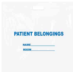
Patient Belonging Bags