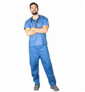
Scrubs and Coveralls

> To learn more, click a category or visit our website